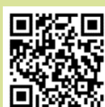
Facebook Staplehurst Parish Council