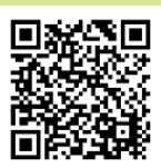
Parish Council Website

For more information visit: www.staplehurst-pc.uk