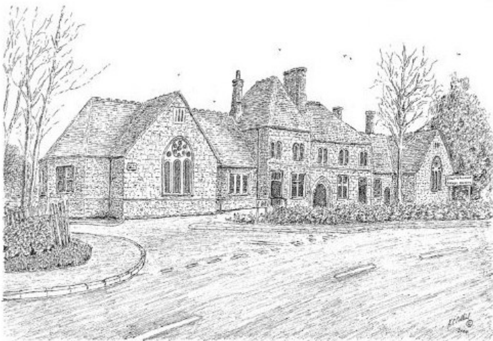
Staplehurst Community Centre